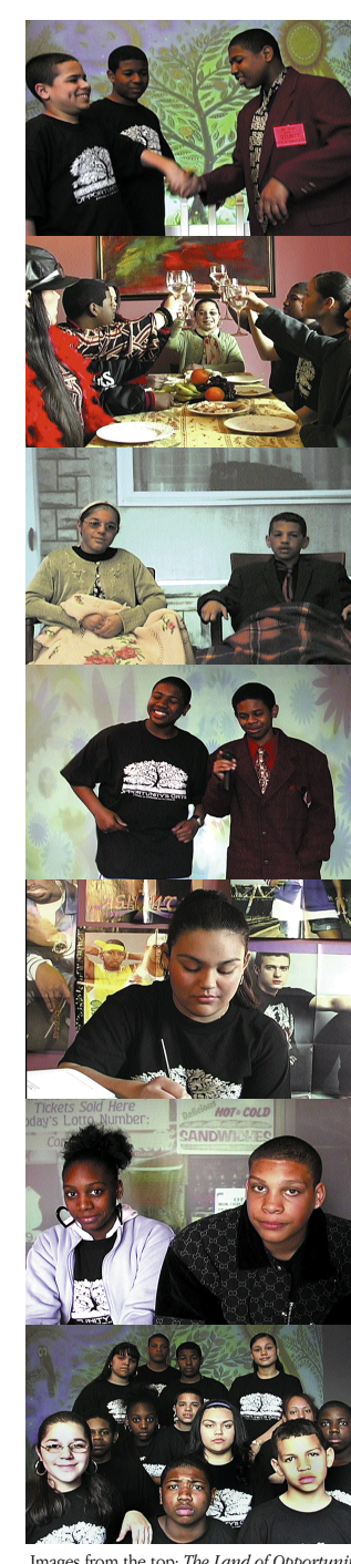
Images from the top: The Land of Opportunity Success, Regret, Let's Make a Deal, The Choice, Waiting for Lottó, and Unity.

A final poem, Unity , describes how, if each individual member contributes, the whole community will advance.